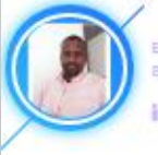
Electrical/Electronics, Math - Specialist